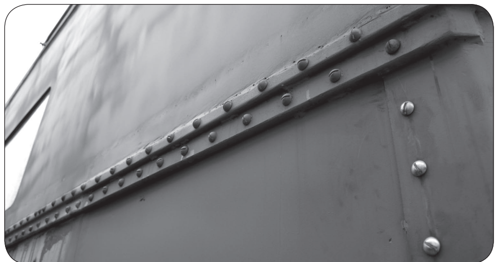
The restored belt rail at the lounge-end of the car, where the old MoW door was filled in. Notice the very effective faux rivets.

The car is currently at Illinois Transit Continued on Page 2