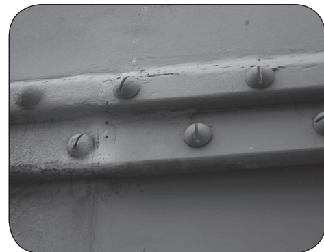
The transition from the original belt rail (left) and the new belt rail (right). This is at the Lounge-end of the car, to cover the MoW doorway.