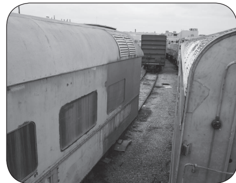
The Lounge-end of Diner 741 where the Maintenance of Way-installed doorway has been closed off.